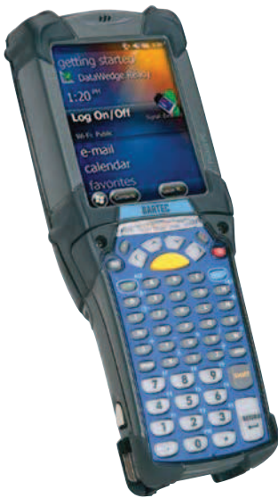
MC 92NO ex -K with 1D-Standard Range Scan Engine or 1D/2D Imager Engine